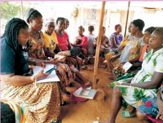
Monthly meeting of the Offia Oji coop group

In 2023, a new group was started in Aguotu, Ishielu Local Government Area, with 15 members.