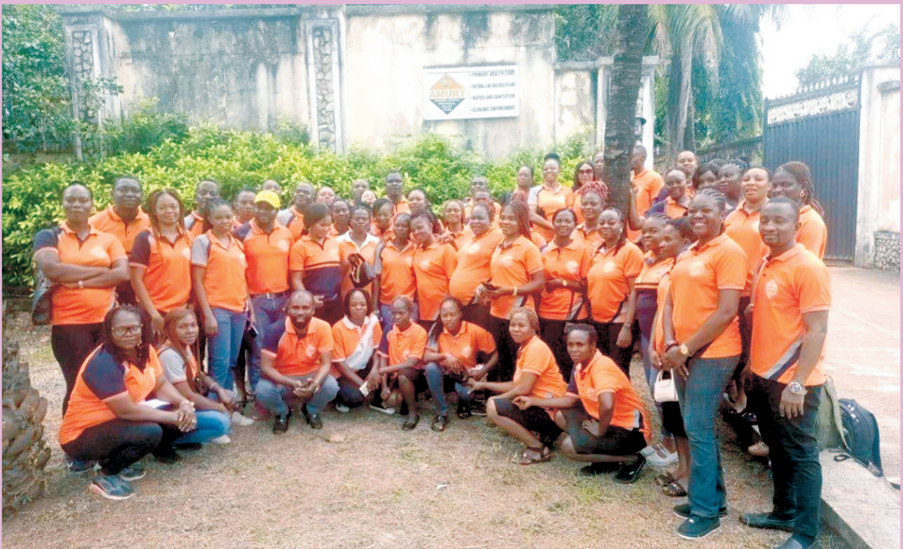
AMURT staff in front of the head office in Abakaliki, Ebonyi State

In 2010, AMURT came to Nigeria and entered into a partnership with Ebonyi State government to extend primary health care services to the remote rural areas. The focus has been on safe motherhood, with over 30000 births and 1450 cesarean sections in AMURT assisted health centers.