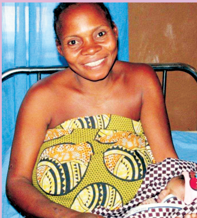
Mother with newborn baby at Ohagelode Health Center

During ANC days, AMURT also provides family planning counseling, routine drugs, tetanus vaccine, and preventive treatment for malaria. It is significant that 51% of the women attending ANC at AMURT assisted health centers in 2023 came from outside the project areas.