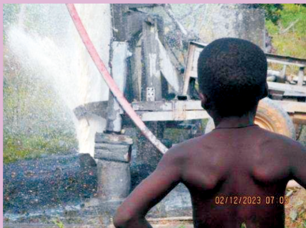
Child watches the drilling of a new borehole at Okpuroji, Onunwangoron, Ishieke