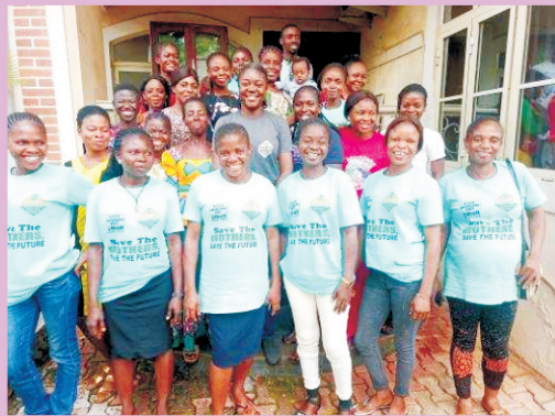
Health education focal persons from the 10 AMURT assisted health centers