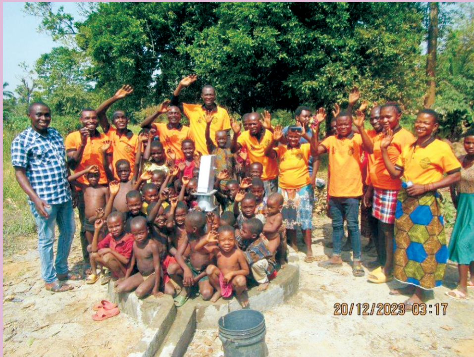
WASHCOM and children after installation of the new borehole at Ogbukputu, Ishieke, Ebonyi LGA

Many rural villages in Ebonyi State still rely on rivers and ponds for their drinking water. The water is often contaminated and causes the spread of cholera, gastroenteritis and other water borne diseases. In 2023, AMURT's water and sanitation team worked in twenty communities in Ishielu, Izzi and Ebonyi Local Government Areas on new borehole projects. Funding came through partnerships with AMURT Italy, Antola Foundation of Switzerland, and private sponsors in the U.S. WASHCOMs (Water Sanitation and Hygiene Committees) were formed and trained on how to maintain the boreholes.