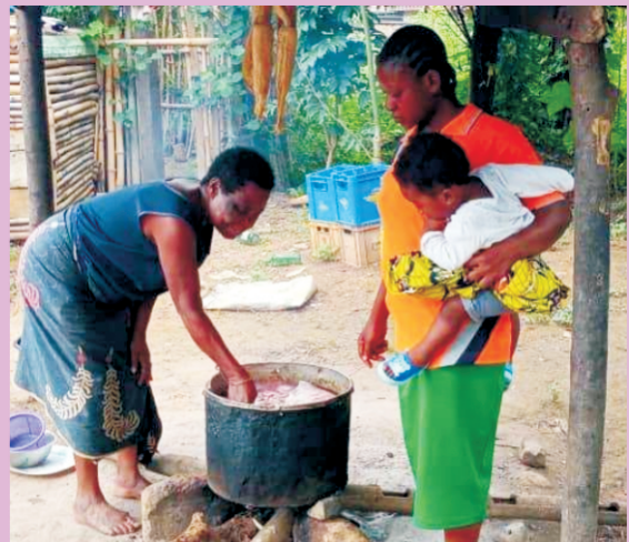
A member of the new Aguotu group working on her cooking business