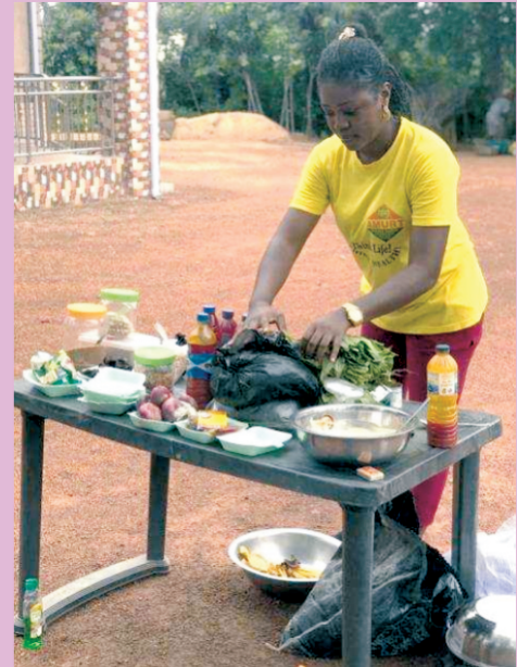
Food demonstration at Ndumbam village, Okpuitumo, Abakaliki LGA

In 2023, AMURT observed an increase in child malnutrition in the rural areas. While poverty is one contributing factor, ignorance plays an even greater role. Many children are left to survive primarily on starchy foods, with cassava being the main crop in the area. To address this, AMURT’s health education department intensified its intervention by organizing food demonstration programs in numerous villages. These programs aimed to teach local communities how to combine locally available foods to provide children with a more balanced diet, including essential proteins.