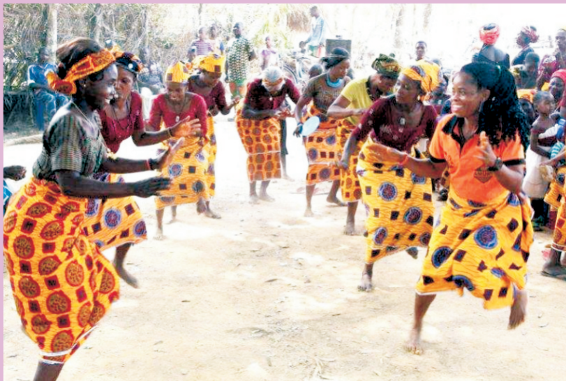
Dancing group during the health rally at Ogboji Central, Ezzagu, Ishielu, LGA