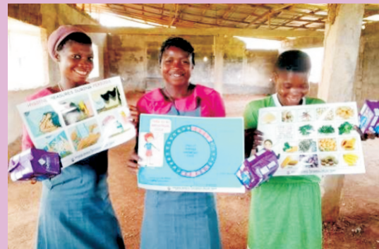
Above photos: Students at Blessed Virginia Secondary School at Uloanwu, Ishieke, were among those receiving sanitary pads on World Menstrual Hygiene Day.