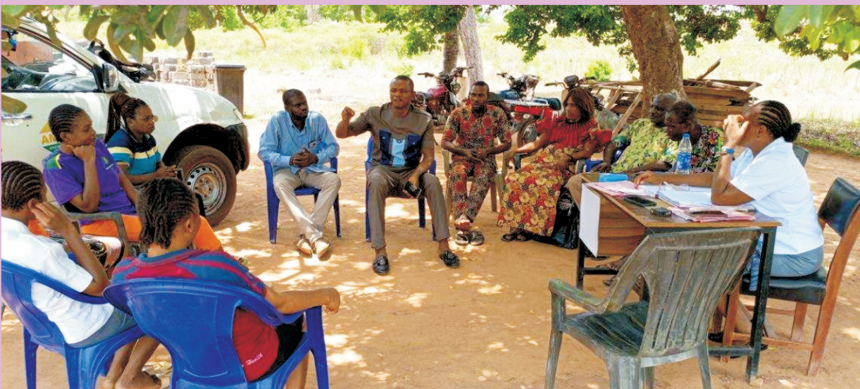
AMURT program department meets with the management committee at Gmelina Health Center

Careful monitoring of financial management and continuous training have yielded good results as health centers now cover their operating expenses, including payment of support staff, while continuing to build savings for maintenance, expansion and upgrades. Strict management of health center revenue and inventory enables the health centers to grow strong and materialize their visions.