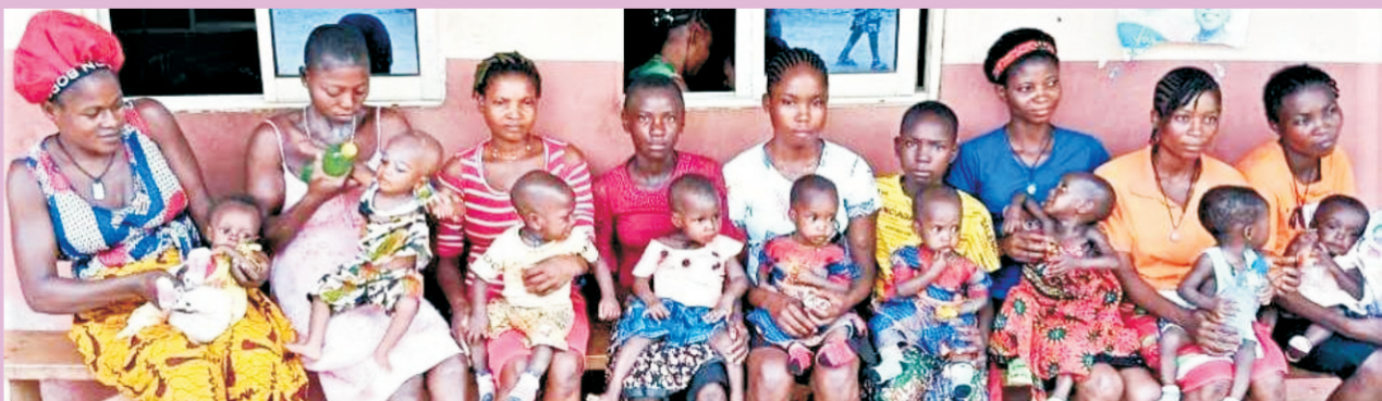
Mothers with their babies for SAM (Severe Acute Malnutrition) clinic at Offia Oji Health Center