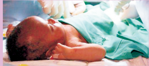
Pediatric surgery at Offia Oji Health Center